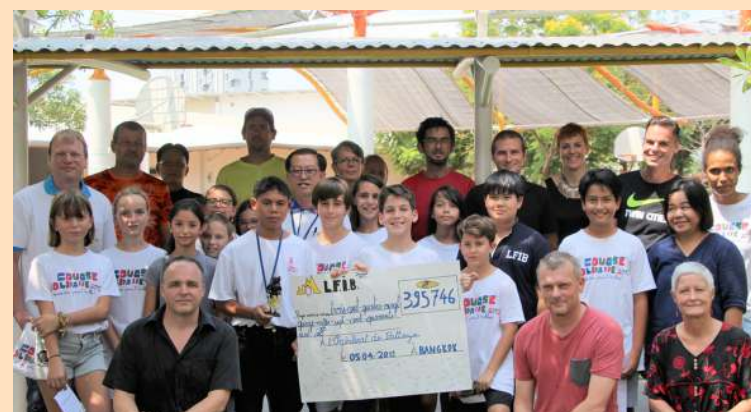
▲ 250 committed and strong runners of 12 primary education classes at Lycée Français International, Bangkok, for supporting the Pattaya Orphanage through their solidarity charity racing project on 8 th March 2019..