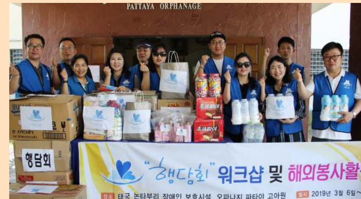
▲ Members of the Lions Club International, South Korea, facilitated by the team of Thai Shin Hwa Travel, for visiting the Pattaya Orphanage, saying hello to our children, and contributing various daily necessities..