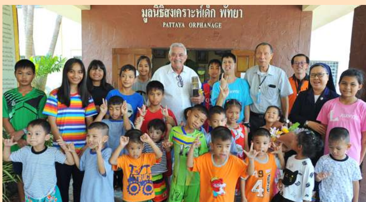
▲ Mr. Johnny Reimar, the renowned singer of Denmark, for paying his most recent visit to the Pattaya Orphanage during his stay in Thailand and saying hello to members of our home..