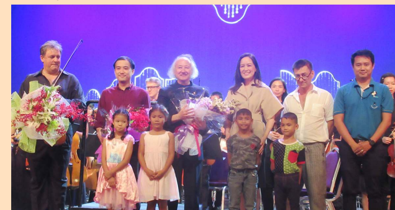
▲ Tiffany's Show Pattaya & Silpakorn University, for organising the grand SSMS Orchestra Concert 2019 – “The Hero”, at the Tiffany's and provided the Pattaya Orphanage with proceeds generated from the event..